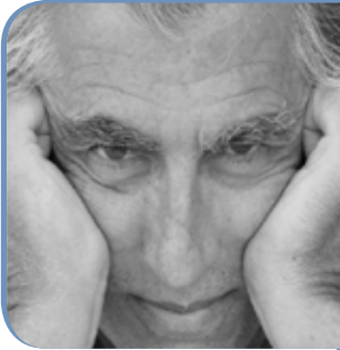
JORDI SIERRA I FABRA

JORDI SIERRA I FABRA was born in Barcelona in 1947. He has published many books and received dozens of Literary Awards from both sides of the Atlantic, among them Spain's National Literature Prize. He is the country's most widely read children's and YA author, with more than ten million copies of his books sold. In the Nineteen Eighties he founded the Jordi Sierra i Fabra foundation in Barcelona and the Foundation Taller de Letras Jordi Sierra i Fabra for Latin America.